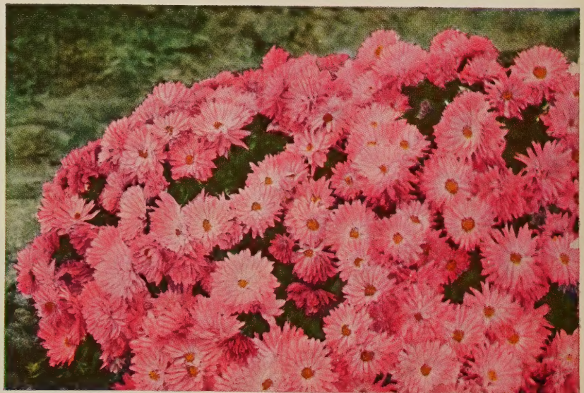
PINK CUSHION. 50c each; 3 for $1.25

30 Sure-to-Bloom Plants $10.00 (5 of each pictured)